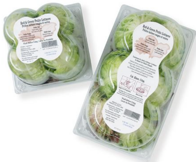
New package is engineered to protect each product as well as the environment